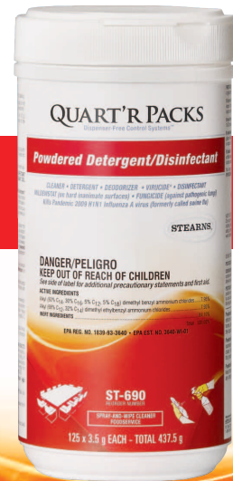
Powdered Detergent/Disinfectant ST-690, 125 count container

Convenient Water-Soluble Packets for Quarts.