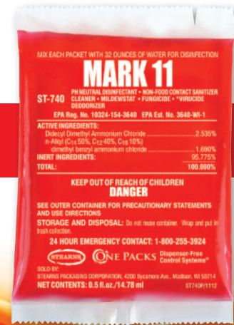
Mark 11 ST-740, 0.5 oz pack

pH Neutral Disinfectant, Non-Food Contact Sanitizer, Cleaner, Mildewstat, Fungicide, Virucide*, and Deodorizer