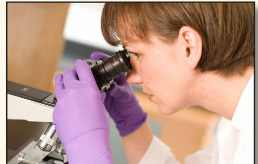
During its EPA registration trials, Mark 11 pH-Neutral Disinfectant Cleaner was successfully evaluated and proven to be effective against H1N1 virus (ATCC #VR-95).

The EPA has stated that the use of a product that makes claims for broad-spectrum kill against Influenza A virus will control H1N1 "Swine Flu". However, most of the strains of Influenza A in the American Type Culture Collection (ATCC) are not the H1N1 strain. Be confident in knowing that Mark 11 has been proven to be a potent weapon in the fight to prevent the spread of this disease.